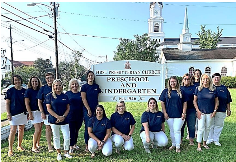
Happy 75th Birthday to First Presbyterian Preschool and Kindergarten! We are very blessed to continue this extremely important ministry to our community.

FIRST PRESBYTERIAN CHURCH 9 West Calhoun Street Sumter, SC 29150 803-773-3814